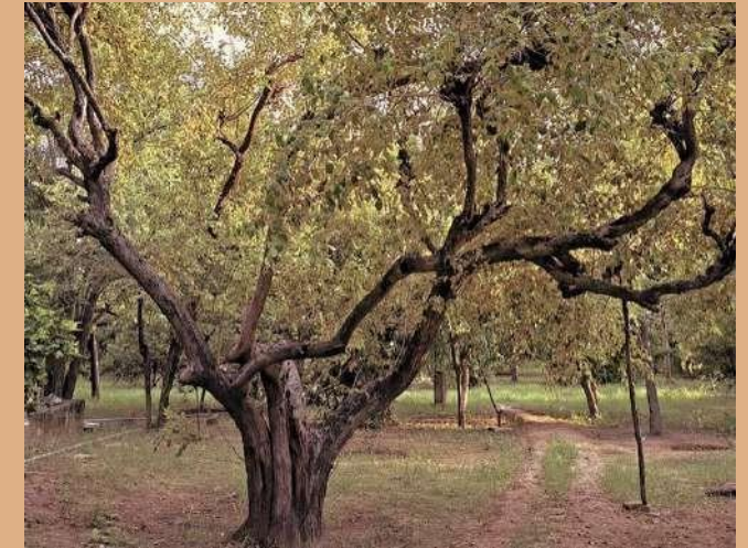
Shri Vatika Amber

www.jaipurjantarhostel.com / +91 9829040897